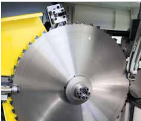
The AMSAW® 350P saw system reduces blade vibration with three blade stabilizers.