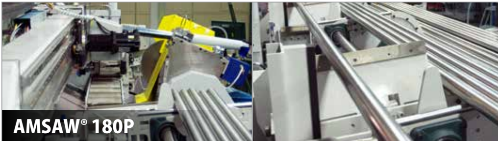
AMS AW® 180P

Fully automated saw with infeed system, bar measuring and spot drilling for agricultural part production.