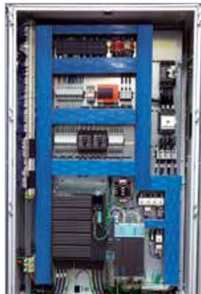
Clean and convenient component layout for easy maintenance.