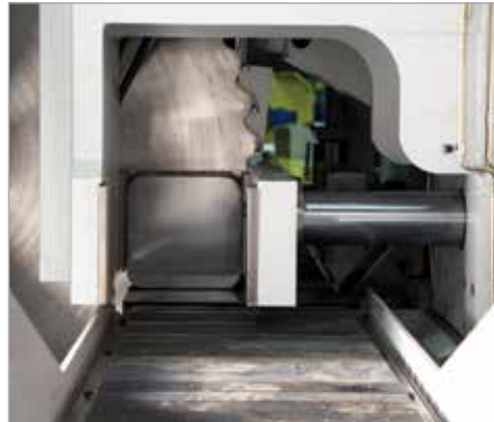
Extremely thin trim cuts and remnant pieces reduce scrap.