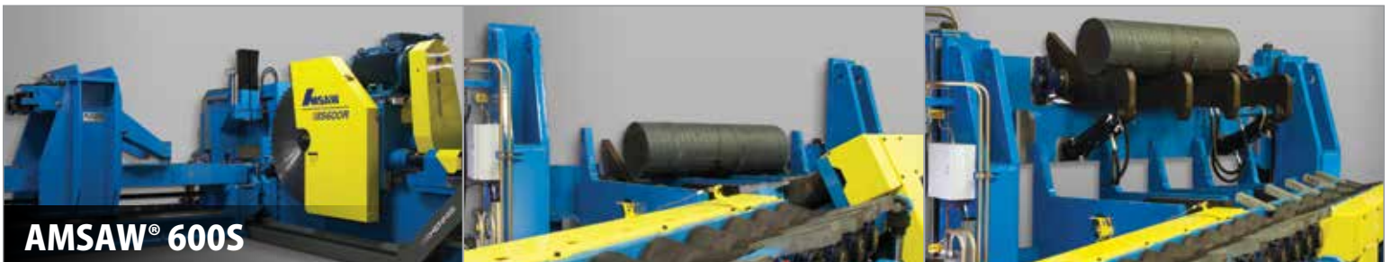
AMS AW® 600S

Heavy duty system for sawing bars up to 600mm diameter. Includes automated bar handling system for both infeed and exit side.