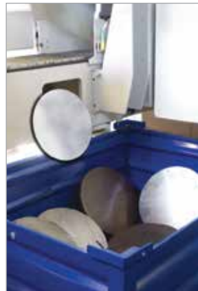
Automatic sorting of different cutoff lengths into 3 to 6 selective bins.