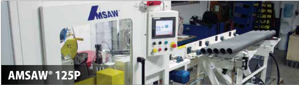
AMS AW® 125P

Fully automated for high production automotive application.