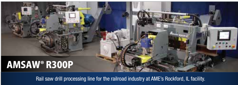
AMS AW® R300P

Rail saw drill processing line for the railroad industry at AME's Rockford, IL facility.