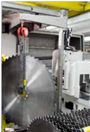
Integrated telescopic swivel hoist and simplified components provide for quick, 5-minute blade changes.