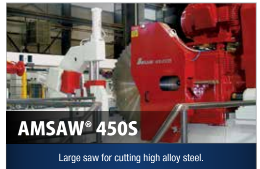
AMS AW® 450S

Rail saw drill processing line for the railroad industry at AME's Rockford, IL facility.